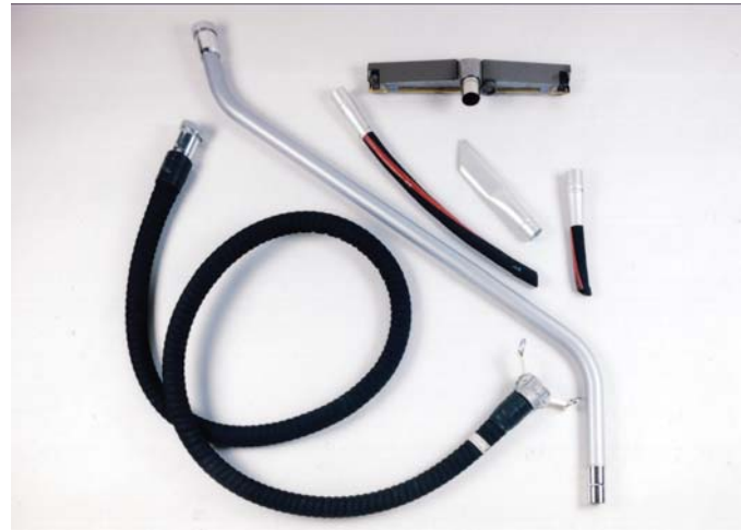
Fuel recovery and depuddling tools