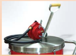
Explosion Proof Manual pump with lid