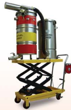
Hydraulic cart (raised) 36" (92cm)