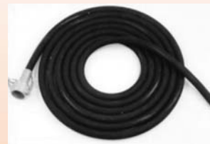
Nitrile Defueling Hose